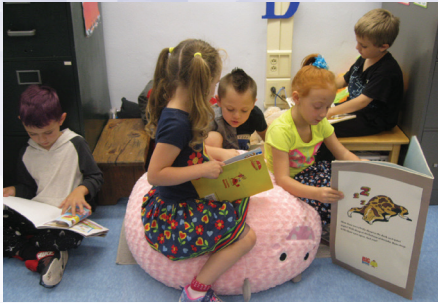
Kinder Reading Nook