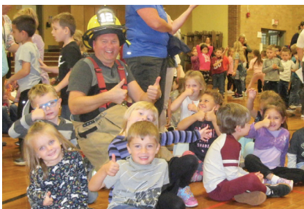
We especially loved the mystery firefighter! Can you guess who he was?