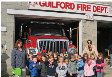
Stop, Drop, and Roll!