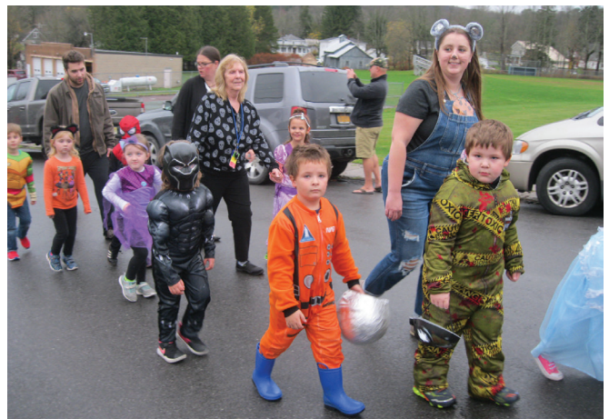
The Dunkin Man came and brought us donuts! Yum! The Bobkittens braved the weather and marched outside. They made it JUST before a huge downpour! It was a spooky blast for all!