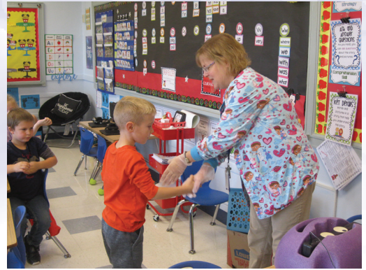
Our nice nurse helped us to learn that handwashing makes us superhero germ fighters!