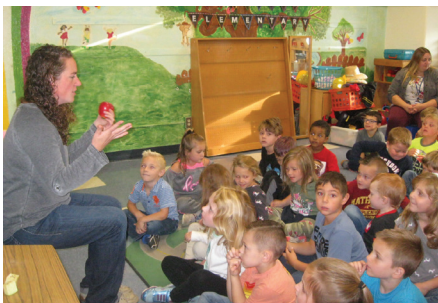
We tasted apple cider, apple varieties, and apple butter!